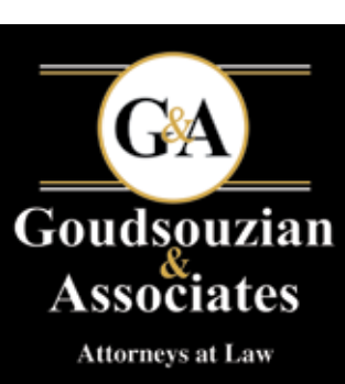
Wills, Estates, Real Estate & Personal Injury

2940 William Penn Highway Easton, PA 18045-5227 P: 610-253-9171 F: 610-559-9281 www.SNG-LAW.com