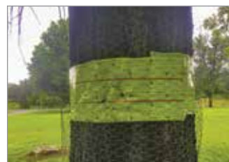
Figure 4. A banded tree covered in chicken wire to prevent mammal and bird bycatch.

any tree, but we recommend only banding trees where SLF is abundant. You can use either sticky bands or a funnel-style trap. Sticky bands may be purchased online or from your local garden center. Push pins can be used to secure the band. While some bands may catch adults, banding trees is most effective for nymphs. Be advised that birds and small mammals stuck to the bands have been reported. To avoid this, you should cage your sticky bands in wire or fencing material wrapped around the tree. Alternately, try reducing the width of the band, so that less surface area is exposed to birds and other mammals. Both of these methods will still capture SLF effectively. To eliminate the risk of catching birds and mammals, you can use funnel-style traps that consist of mesh wrapped around the tree that leads into a container to trap SLF (Figure 5). Some companies may be producing these traps commercially, or you could also make your own. The mesh (e.g., plastic netting) should be wrapped around the entire circumference of the tree and funnel into a container (e.g., inverted peanut butter jar or plastic bag) with a hole in the lid to allow SLF nymphs and adults to pass through. Read more